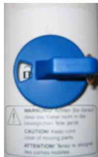
Deactivate the control lock